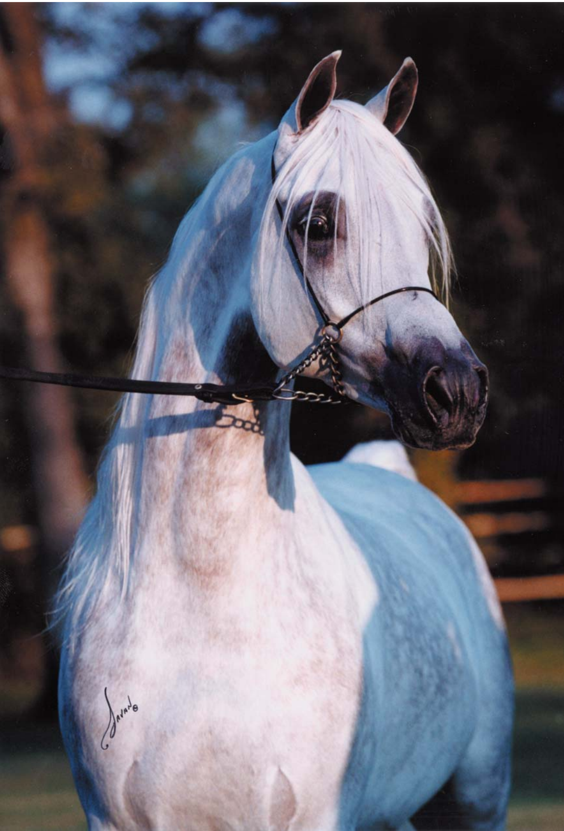
*Mishaal HP (Ansata Sinan x Mesoudah M).