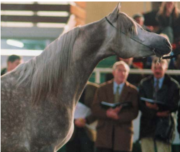
*Mishaal HP was awarded a Platinum rating at the European Stallion Licensing, the highest rating a horse can get.